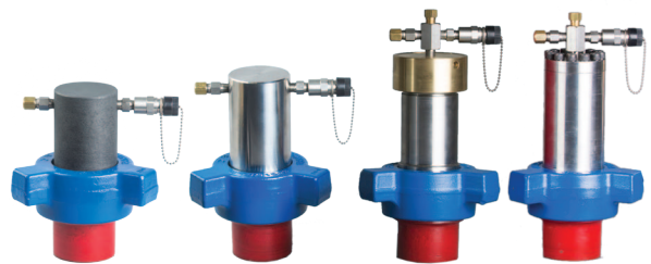
Sensor, Diaphragm Protector, Piston Isolator or De booster