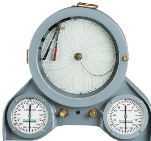
12" Circular Chart Recorder, Portable, with 5" Pressure Gauges