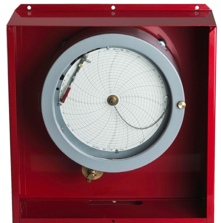
12" Circular Chart Recorder, Box Mount