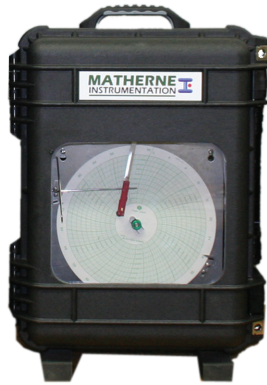
8" HD Chart Recorder

Matherne Instrumentation's "HD" Heavy-duty line of chart recorders are an accurate and reliable means for the measurement and recording of pressure in a variety of applications.