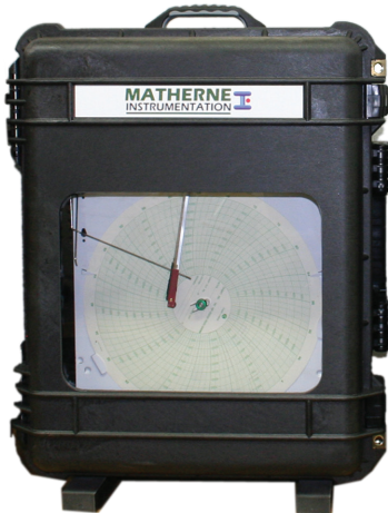
12" HD Chart Recorder