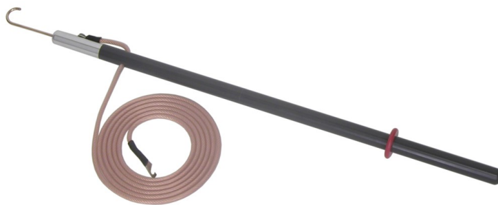
ES30 Earthing stick

If you require a different output voltage test system, please contact us with your specification and we will quote for a custom design.