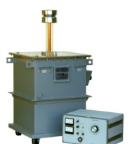
KV100-100 100kV 100mA

High voltage test systems are also available from T&R Test Equipment up to 100kV 100mA.