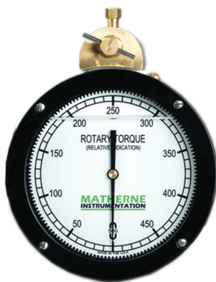
6" Rotary Torque Gauge Box Mount