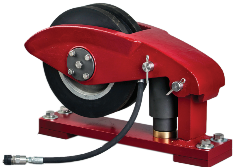
Rotary Torque Idler Assembly